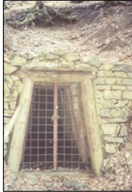
An old mine entrance near the excavation sites.