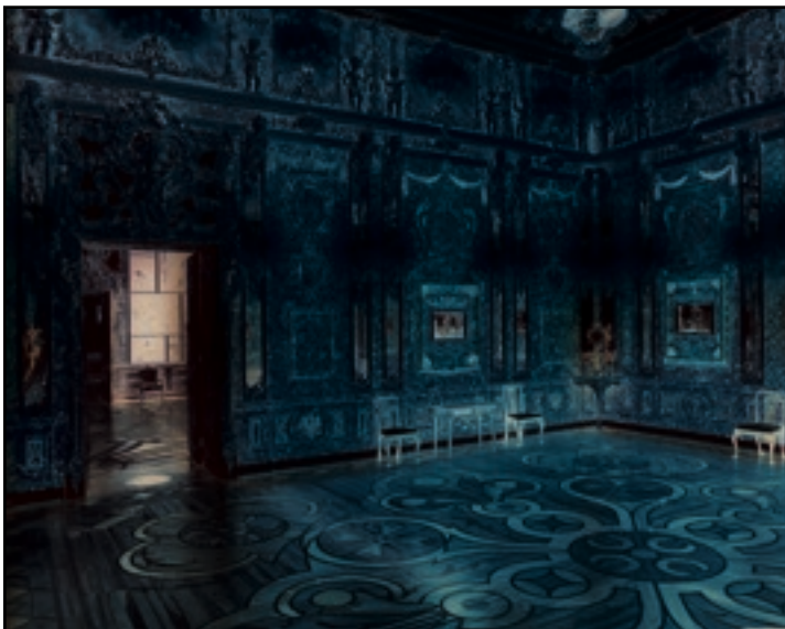
The reconstructed Amber Room at Tsarskoye Selo, more commonly known as Catherine Palace, outside St. Petersburg, Russia.

Seemingly exciting news was reported in February from an area of Germany just across the Czech Republic border where treasure hunters have been searching for years for the lost Amber Panels. These famed wall panels were gifted by King Frederick William I of Germany to Peter the Great of Russia in 1716. Each piece of translucent brownish-yellow fossil was painstakingly hand carved and fitted by