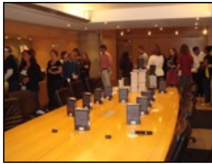
Book signing at Hachette's offices.