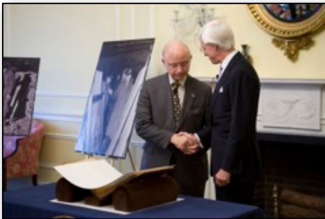
November 1, 2007