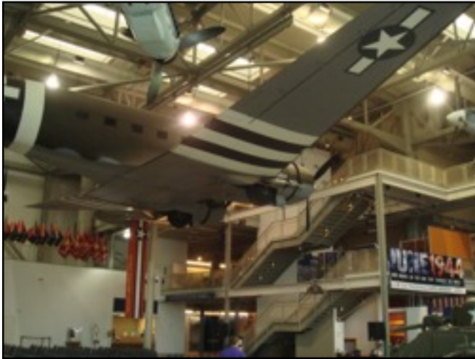
This C-47 transport plane is just one of several aircraft that hang overhead in the museum's entry hall.