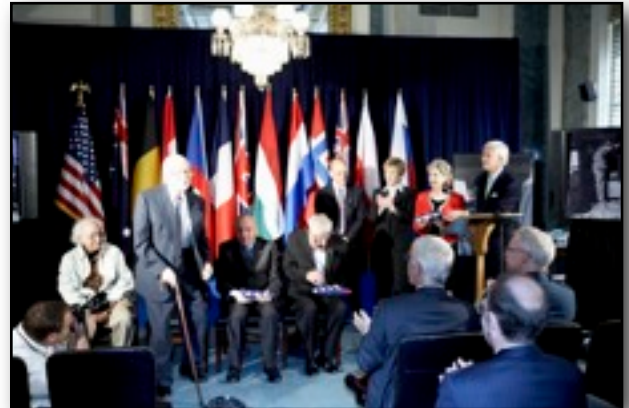
June 6, 2007