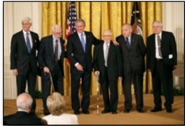
November 15, 2007