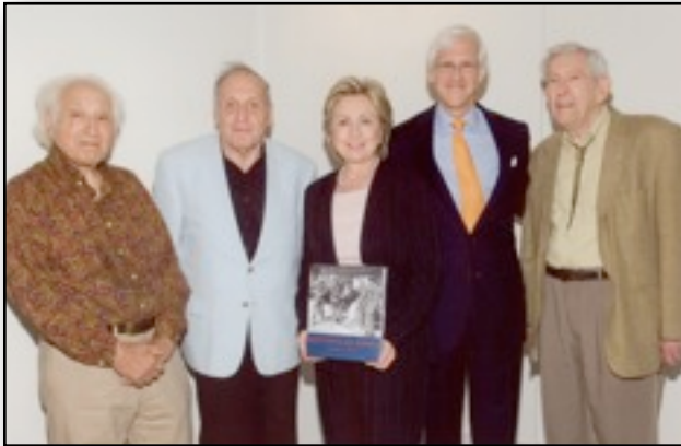
June 5, 2007