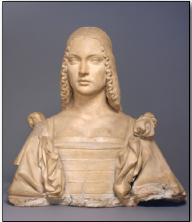
Attributed to Gian Cristoforo Romano, Italian (c. 1465–1512) Portrait of a Woman, Probably Isabella d’Este, c. 1500 Terracotta, formerly polychromed 21-3/8 x 21-1/2 in. (54.3 x 54.6 cm)