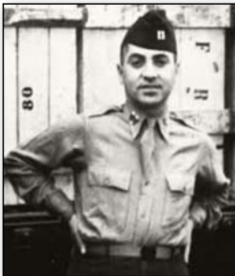
Col. Pomrenze at the Offenbach Archival Depot after World War II.

Monuments Man Colonel Seymour Pomrenze has passed away at the age of 95. A decorated US Army veteran and loving father and husband, Seymour played a significant role in the restitution of looted items during WWII.