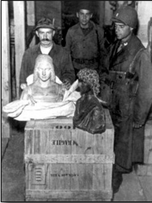
The Bust of Isabella d'Este in the saltmine of Altaussee, Austria in May 1945.

salt mine in Altaussee, Austria. In early May 1945, during the closing days of the war, the Monuments Men were in a race against time to locate the last great Nazi repository of stolen works of art. A key tip led them to the Steinberg mine. They arrived to discover that a Nazi plot to destroy the salt mine and its priceless contents, including more than 6,000 paintings, had only hours before been thwarted, a harrowing story recounted in The Monuments Men: Allied Heroes, Nazi Thieves, and the Greatest Treasure Hunt in History .